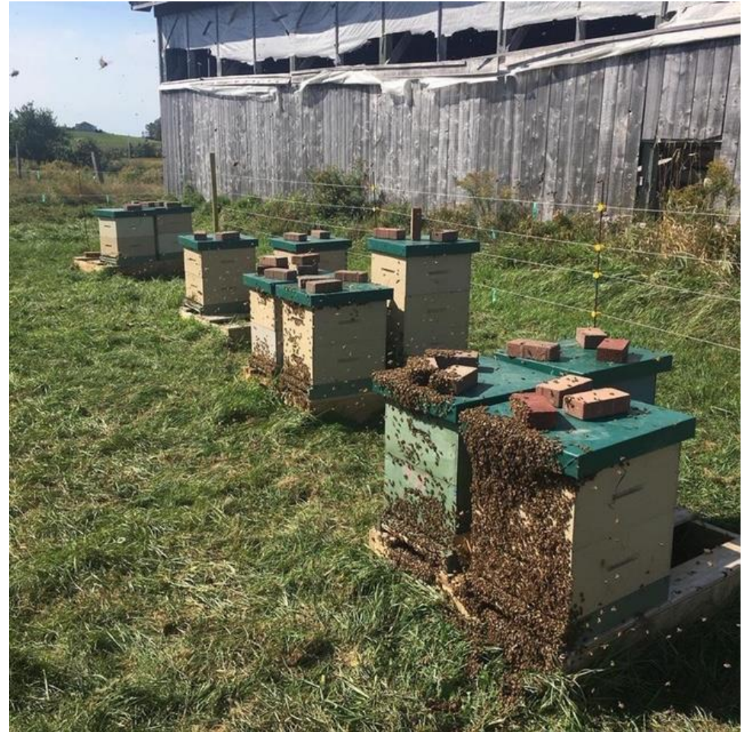
Double Brood Chambers VS Single brood Chamber