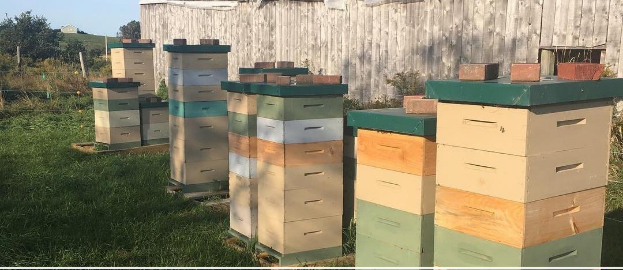
Sunny Cove Honey hives on the old farmland